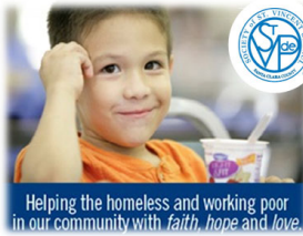
Helping the homeless and working poor in our community with faith, hope and love